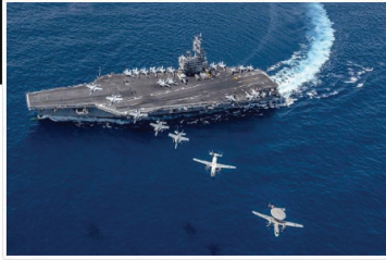
Four of China's neighbors protest latest South China Sea map