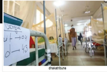
Dengue bites Bangladesh: 2,352 hospitalized, 21 dead in 24 hours