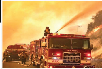
US government sues Southern California Edison for 2020 Bobcat