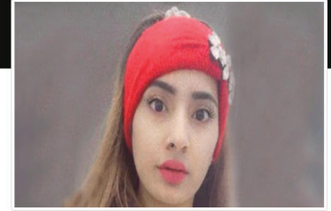
'Honor killing' suspect extradited from Pakistan to Italy